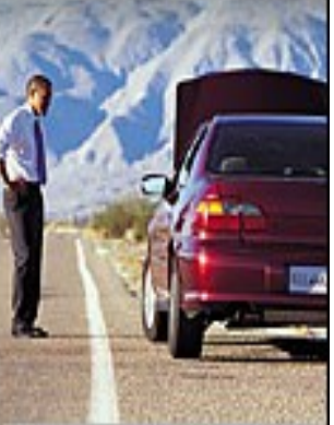
For details visit www.sd3fcu.org

REPAIR COSTS ARE ON THE RISE! Get your free, instant quote on an extended warranty.